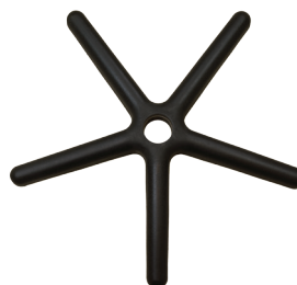
5-Point Base (1)