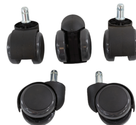
Caster Wheels (5)